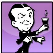
MEN'S NIGHT OUT

Please contact the Prayer Chain for urgent or special prayer needs: Val Appleton (01943 430553) or Val Worrall (01943 601945)